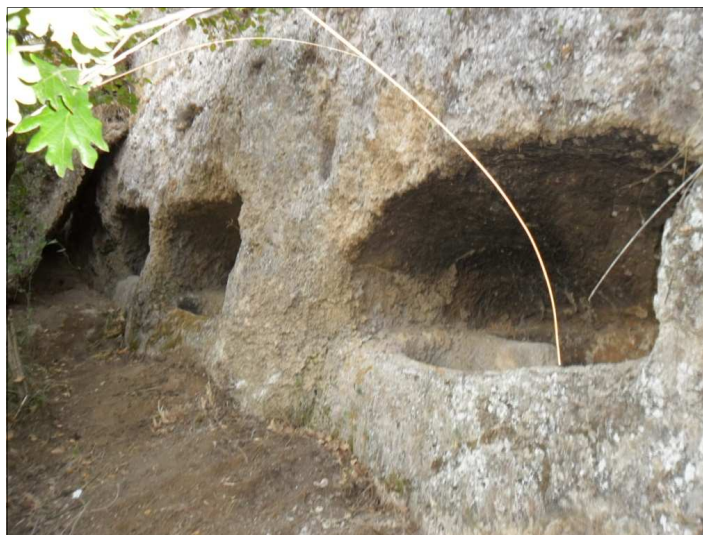
St. Pantaleone - Byzantine Acrosolia Tombs